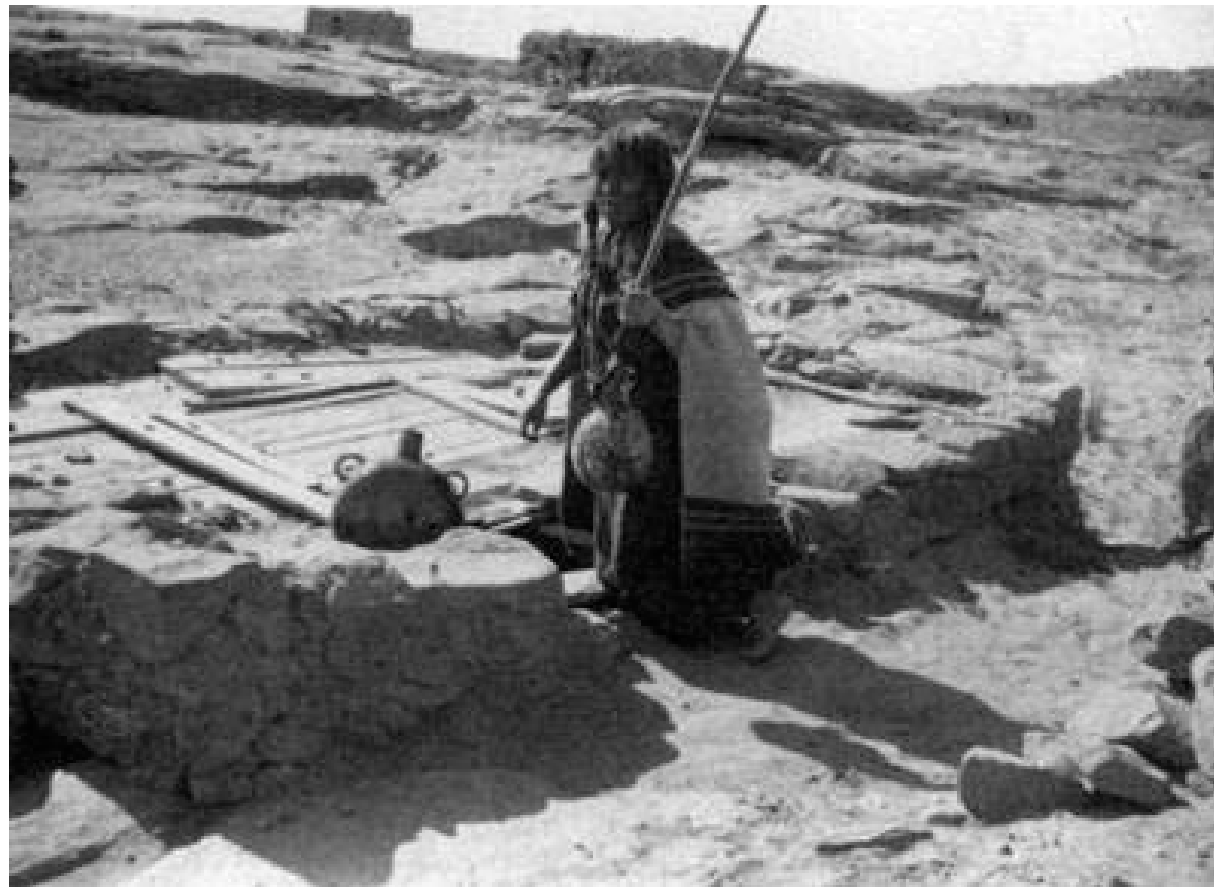
Woman Drawing Water from Cistern at Orabi Pueblo (circa 1880-1900)